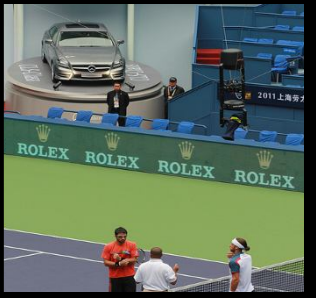
Mercedes-Benz featured a vehicle on display courtside at the Shanghai Rolex Masters