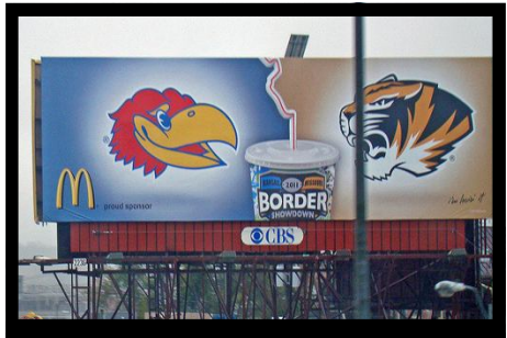
McDonalds creatively positioned its brand in the Kansas-Missouri Border War with this OOH display