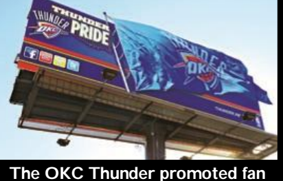
The OKC Thunder promoted fan loyalty during the lockout with a billboard adorned with a massive team flag and social media icons