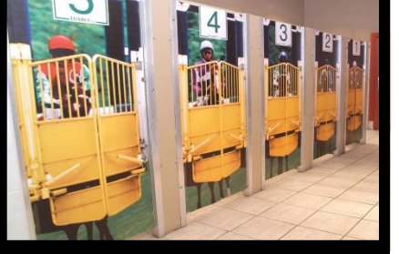
LuxBet reminded horse racing fans that they could "bet from anywhere" with a creative restroom stall branding display