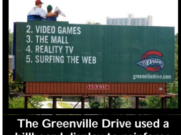
billboard display to reinforce the value proposition of attending a game versus other forms of entertainment