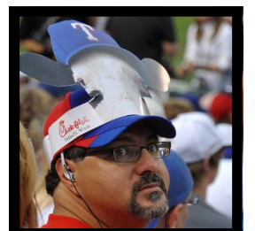
Chick-fil-A capitalized on the Rangers' playoffs fever with cool branded giveaways