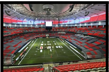
The New BC Place Showcases the Future of Stadium Lighting http://bit.ly/sb1oFJ