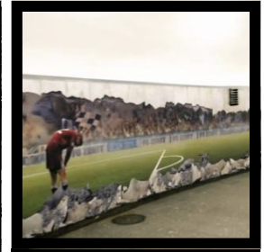
FC Zenit (Russia) recently unveiled a massive metro walkway ad http://is.gd/giTvOm