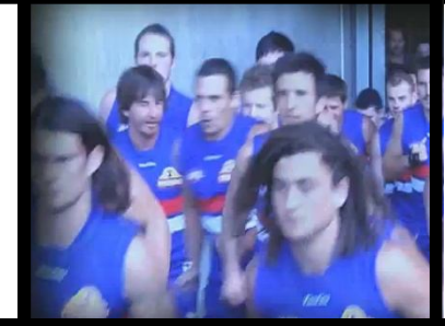
The Western Bulldogs captured their brand story in a terrific web video: http://bit.ly/vB7zwd