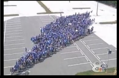
The Tampa Bay Lightning called on fans to make a human lightning bolt at TIA Airport