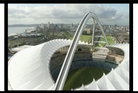
Red Bull Athlete Brian Capper Soared Over Moses Mahiba Stadium on a Motorbike: http://bit.ly/smRCli