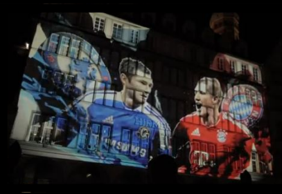
Project Branding In Ways That Fans Have Never Seen Before http://bit.ly/KUaVUa