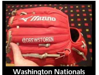
stitched his Twitter handle into his glove. Will this become new inventory for guerilla marketing?