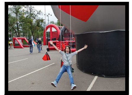
Fans enjoyed riding giant soccer ball swings in the Fan Fest area at UEFA EURO 2012