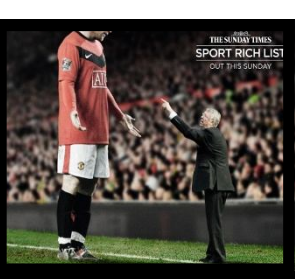
The Sunday Times used a creative outdoor illustration to drive sales of its "Sports Rich List" publication