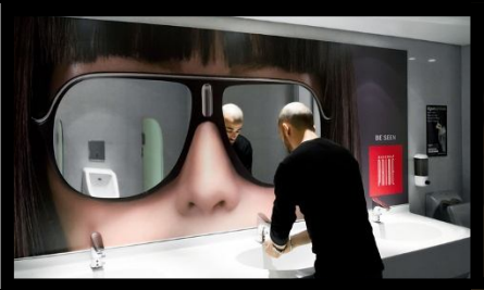
Feature Sunglass / Eyewear Partners Prominently in Stadium Restrooms http://bit.ly/KAxF88