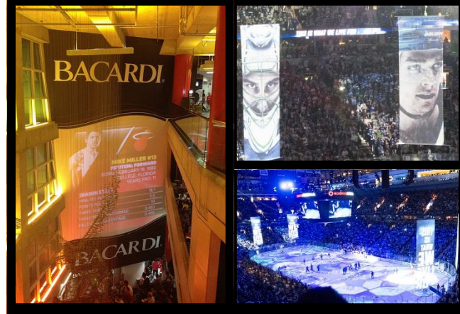
See how the Canucks use DPI here: http://bit.ly/LS5Tpb

Looking to use projection technology outdoors? See how Manchester City FC projected a Blue Moon in the stands at Etihad Stadium: http://bit.ly/N78P6m