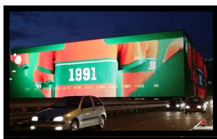
Heineken leveraged the massive LED display wall at the Ziggo Dome to demonstrate its support for the Dutch during UEFA EURO 2012