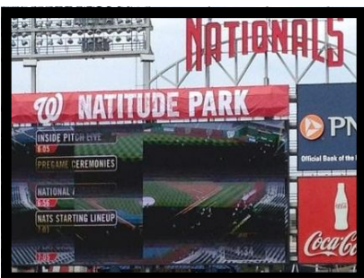
The Nationals took their 2012 team slogan, "Natitude" to the next level by displaying a massive "Natitude Park" sign in the outfield of their stadium