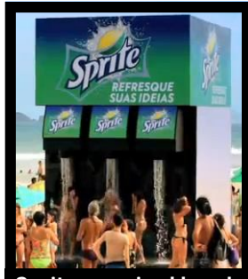
Sprite surprised beach goers with a refreshing shower and product sampling http://bit.lv/JHv/4C