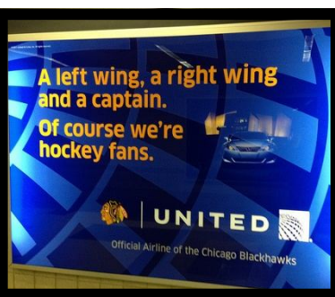
United used creative messaging in its concourse advertising to capture the attention of loyal Blackhawks fans