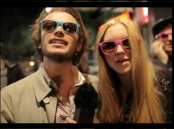
Give Fans an Incentive To Look Signage (e.g. Make It Invisible) http://bit.ly/KpkCfL