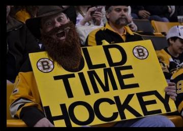
Distribute Branded Posters with Head Cutouts and a Coupon For Redemption on the Back