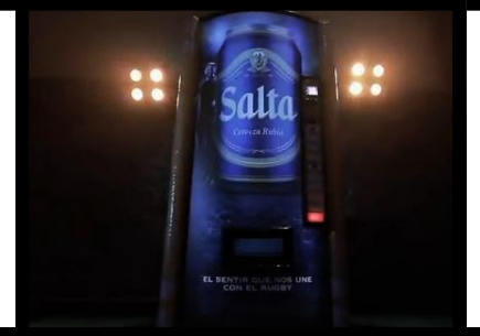
Salta Beer Created The Ultimate Vending Machine For Rugby Fans http://bit.ly/JCwuFG