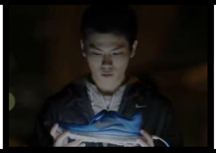
Nike Gives Fans the Power to Control the Unthinkable