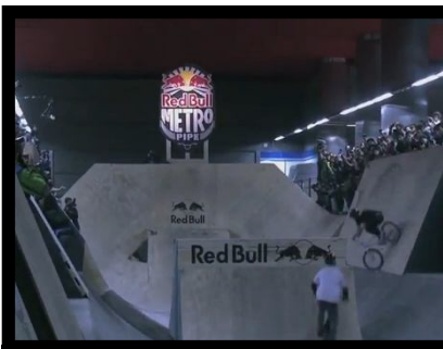
In Madrid, Red Bull turned a subway station into an underground BMX Park to host a Red Bull Metro Pipe event: http://bit.ly/KFP0RU